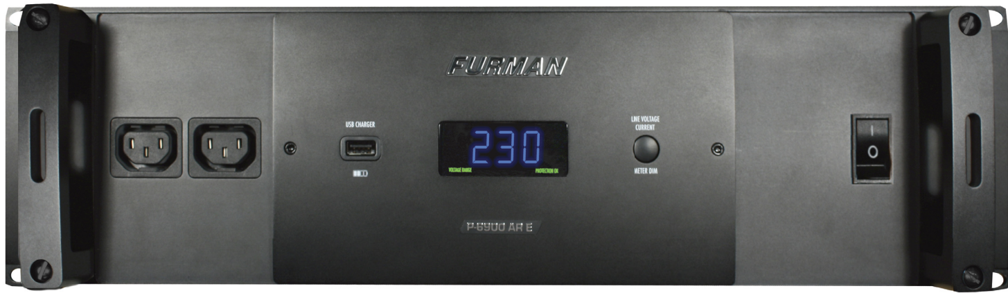
(Note - Preliminary design, subject to change)

The 30 Amp P-6900 AR E delivers a stable 230 volts of AC power to protect equipment from problems caused by AC line voltage irregularities such as sags, brownouts, or overvoltages - all of which can cause sensitive electronic equipment to malfunction or sustain damage. The P-6900 AR E accepts any input voltage from 188V to 270V and transforms it to a constant output of 230V or 240V (switchable), ±10V. Voltages beyond that range may also be converted to usable levels, depending on the range variance.